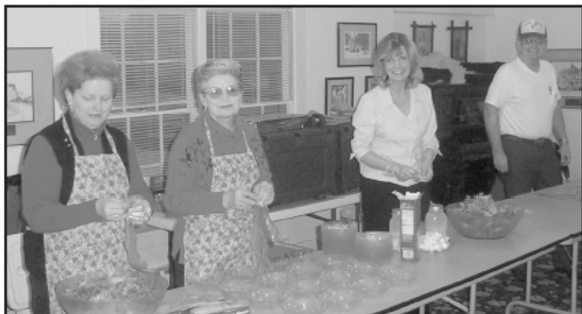
The crew from Rheba's Catering ready to serve a fantastic Valentine Dinner.

Unless the enthusiasm overcomes us and we just can't wait, the next dinner will not be until November but guaranteed you won't want to miss it!